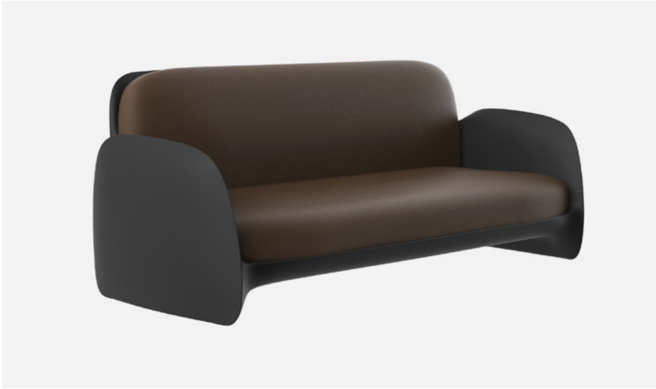
PEZZETTINA BY ARCHIRIVOLTO DESIGN