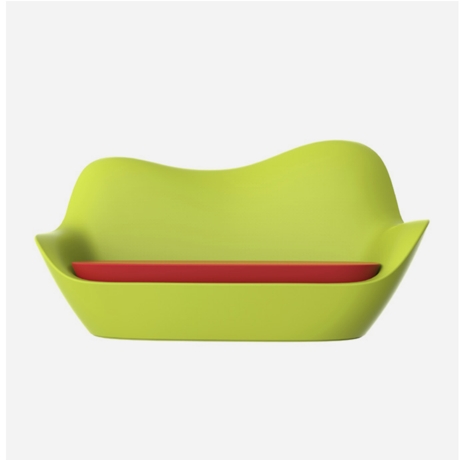
SABINAS BY JAVIER MARISCAL