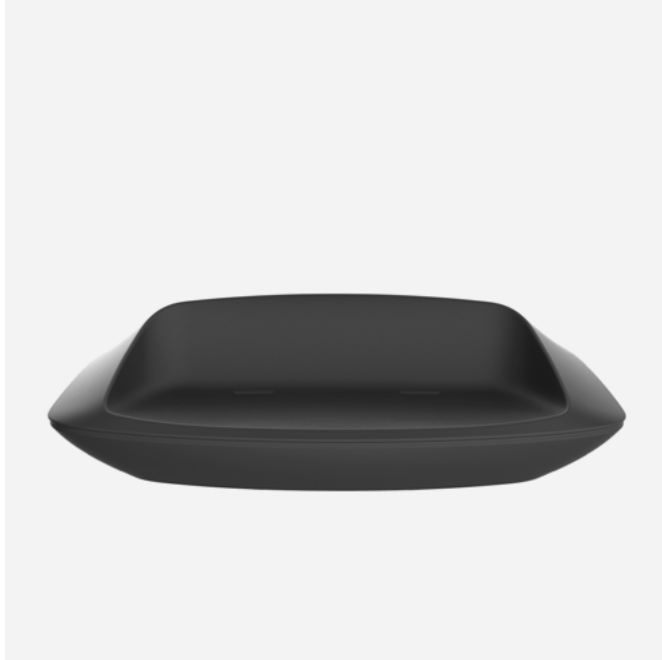
BLOW BY STEFANO GIOVANNONI