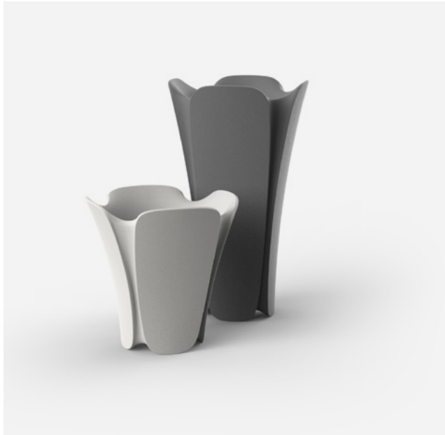
PEZZETTINA BY ARCHIRIVOLTO DESIGN