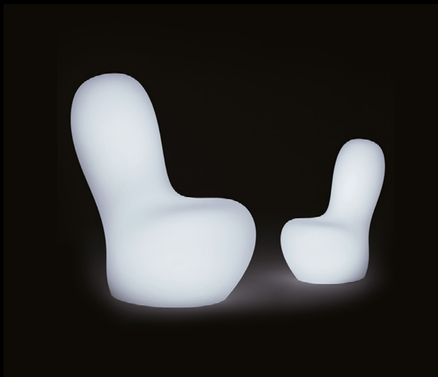
SABINAS BY JAVIER MARISCAL