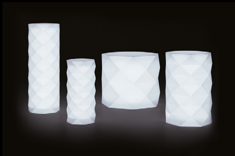
MARQUIS BY EUGENI QUITLLET