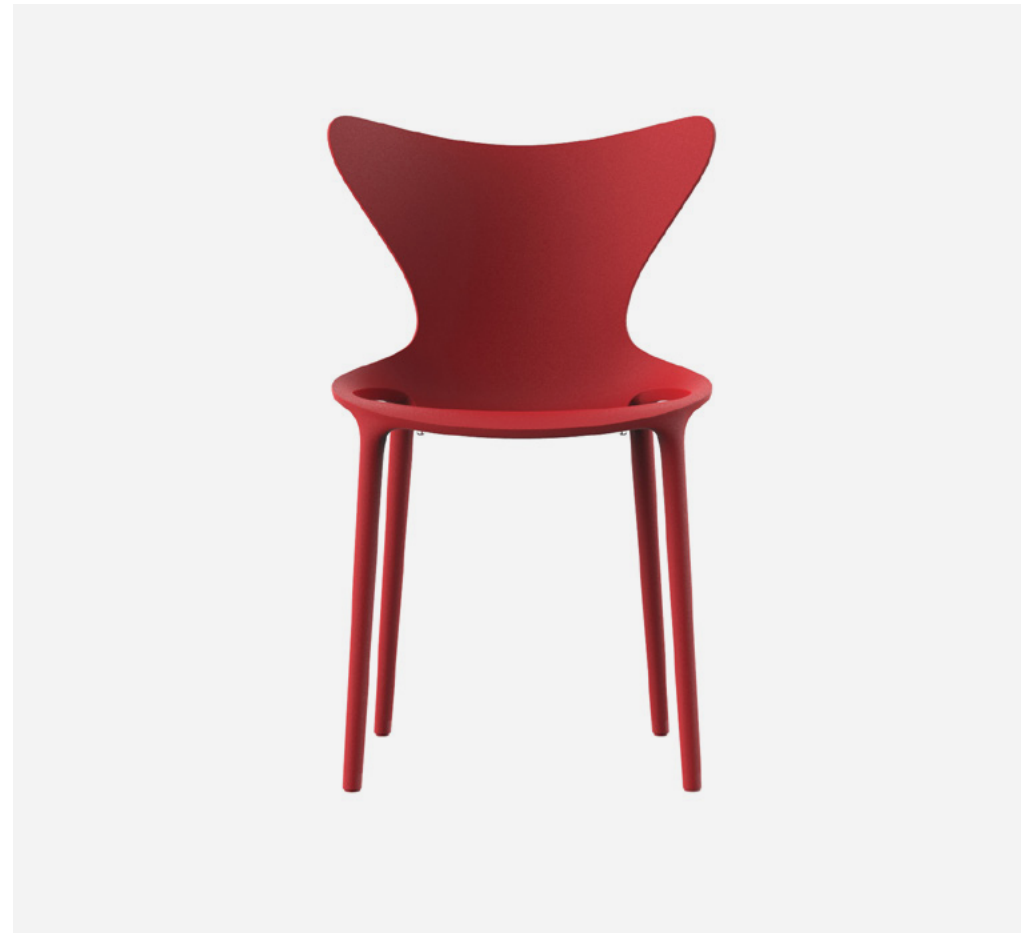
LOVE BY EUGEENI QITLLET