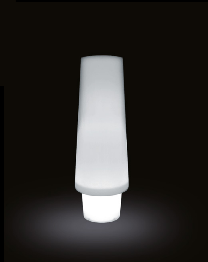
ULM BY RAMÓN ESTEVE