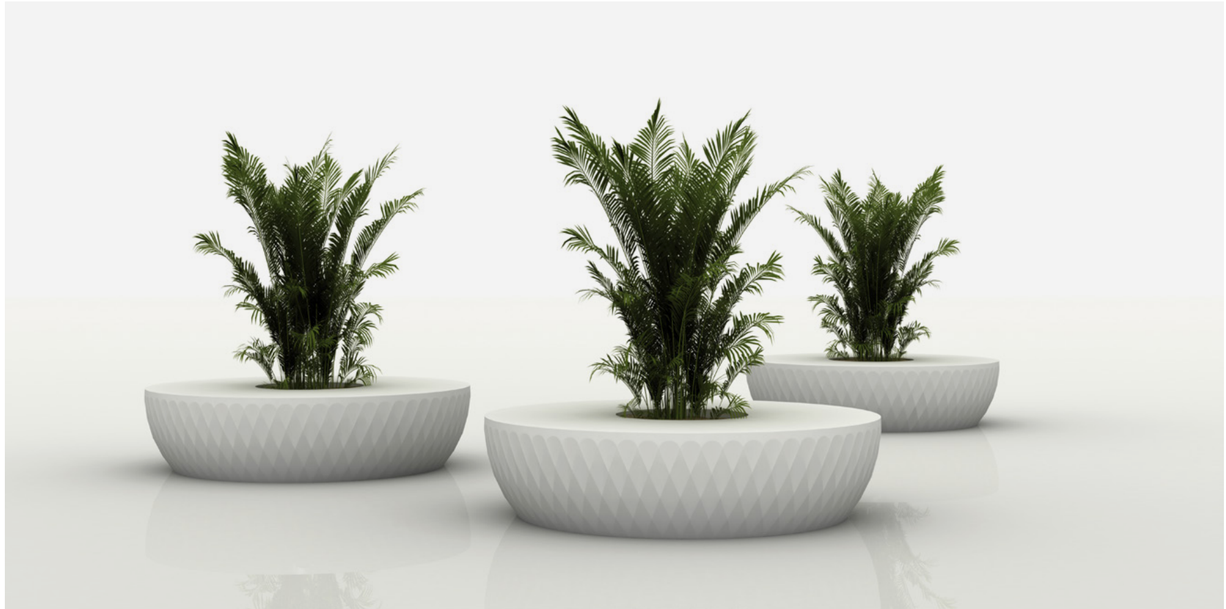
VASES BY ESTUDI{H}AC