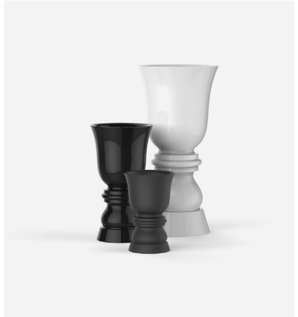
SUAVE BY MARCEL WANDERS