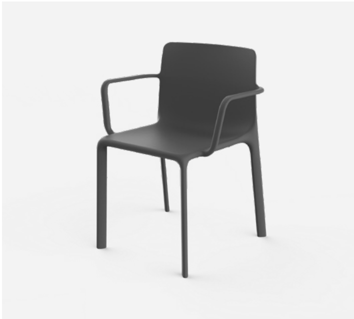
QUARTZ BY RAMÓN ESTEVE