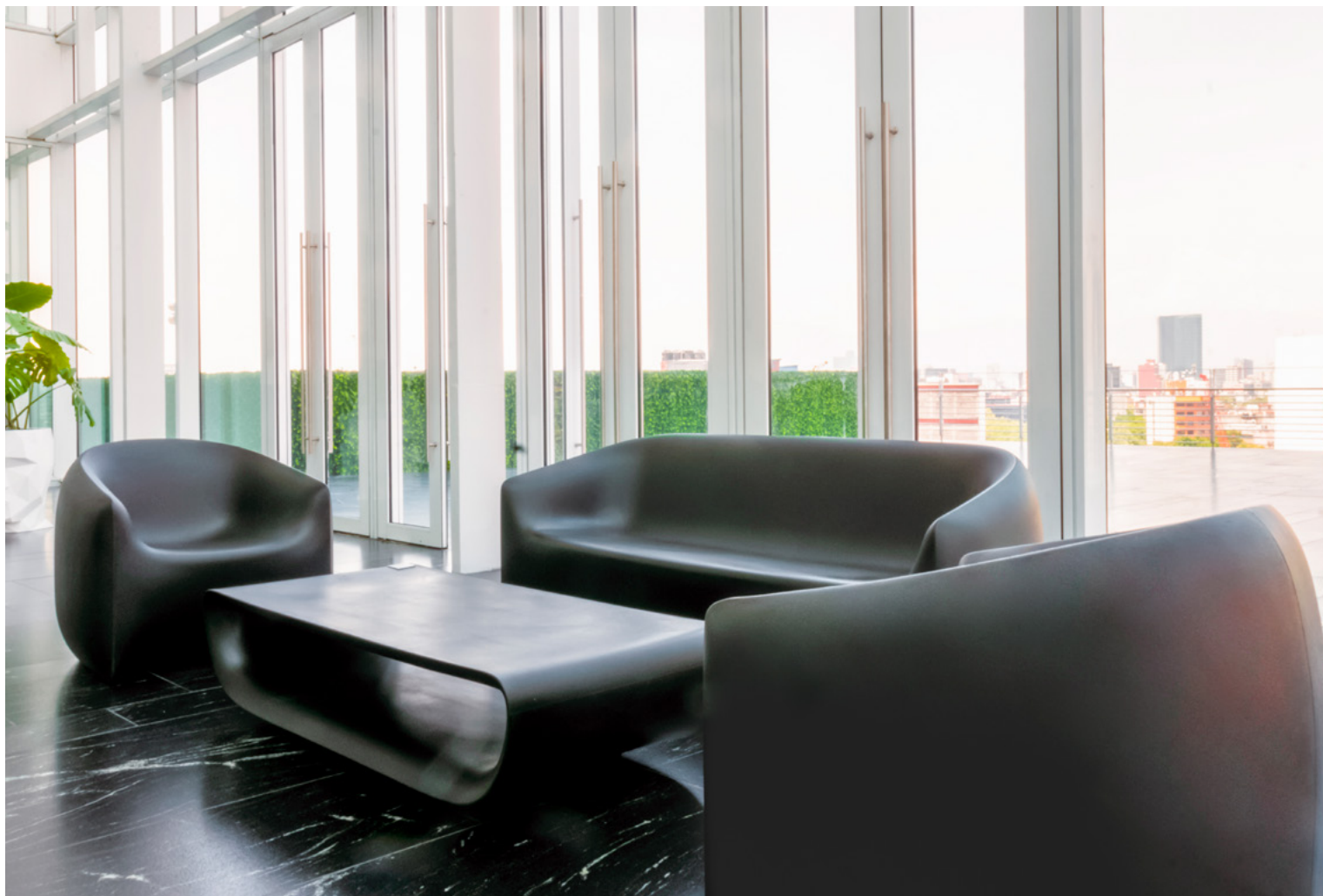
BLOW by Stefano Giovannoni · Bum Bum by Stefano Giovannoni