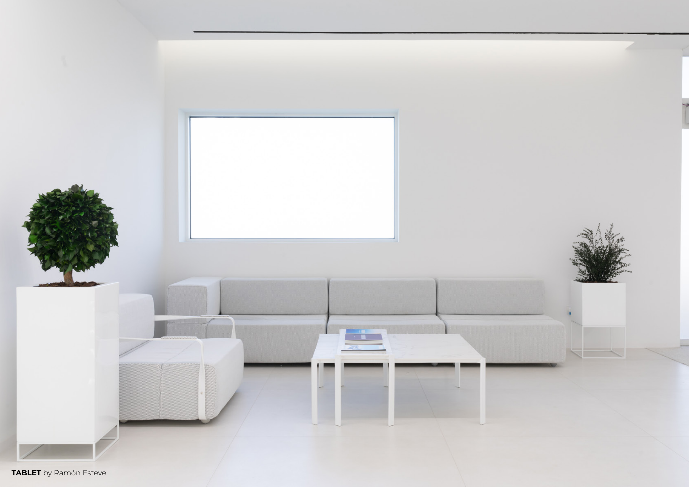
TABLET by Ramón Esteve